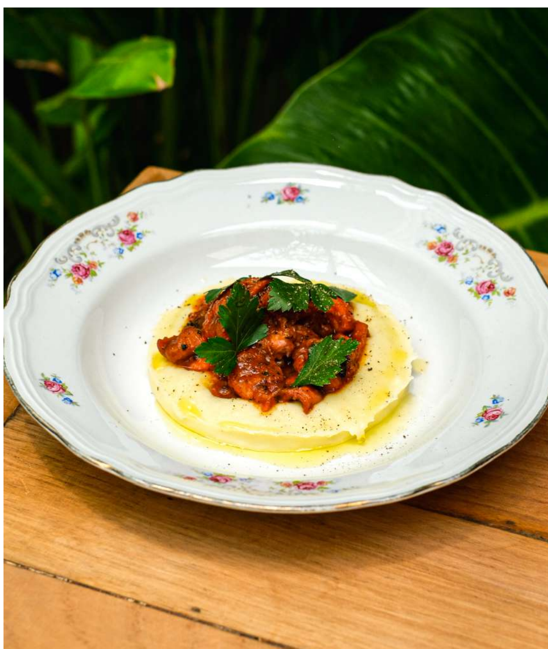
Moscardini E Puree' Baby octopus in rich tomato sauce and mash potato

All prices are subjected to 10% government tax and service charge