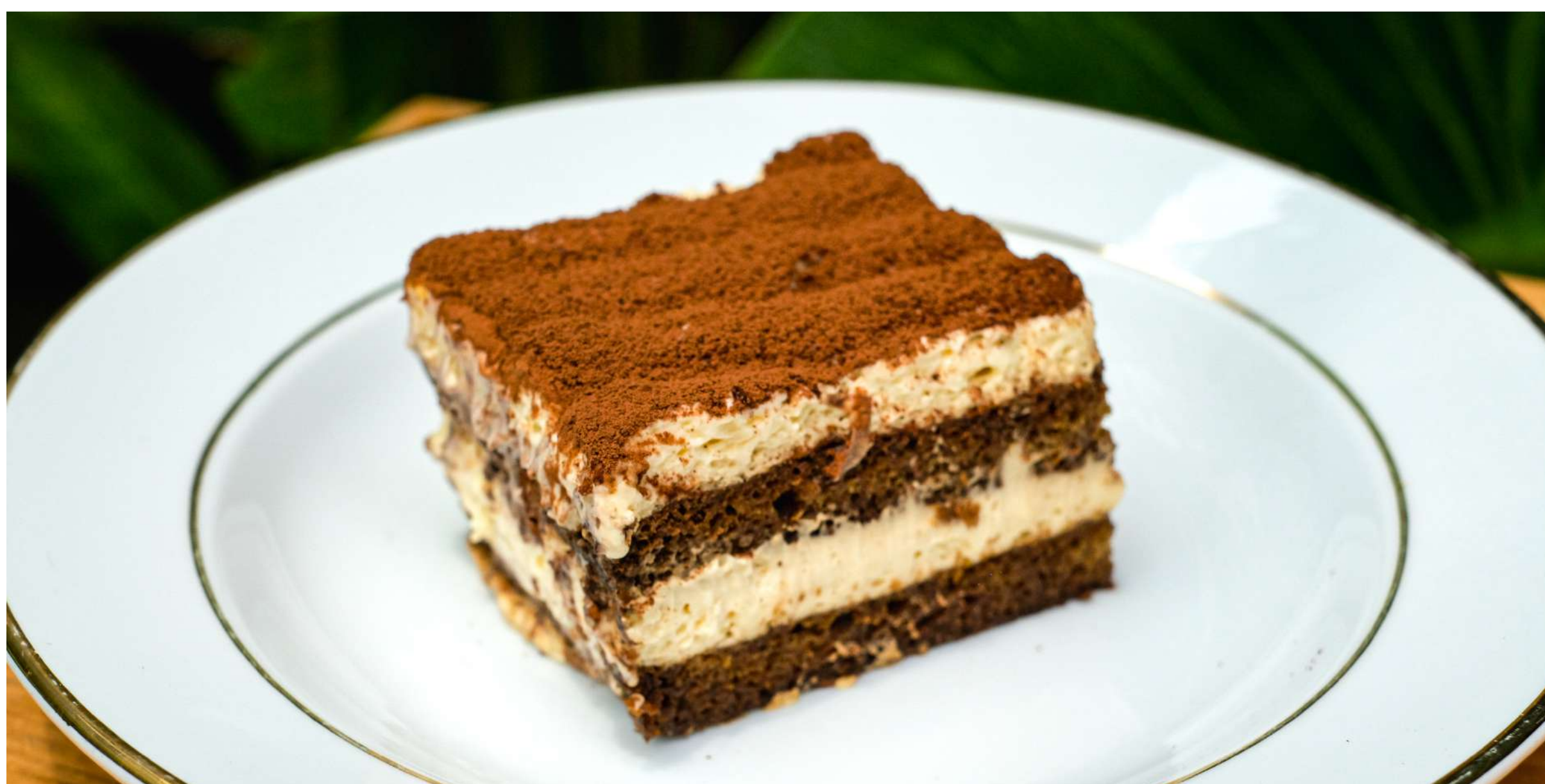
Tiramisu Mascarpone cream, espresso coffee