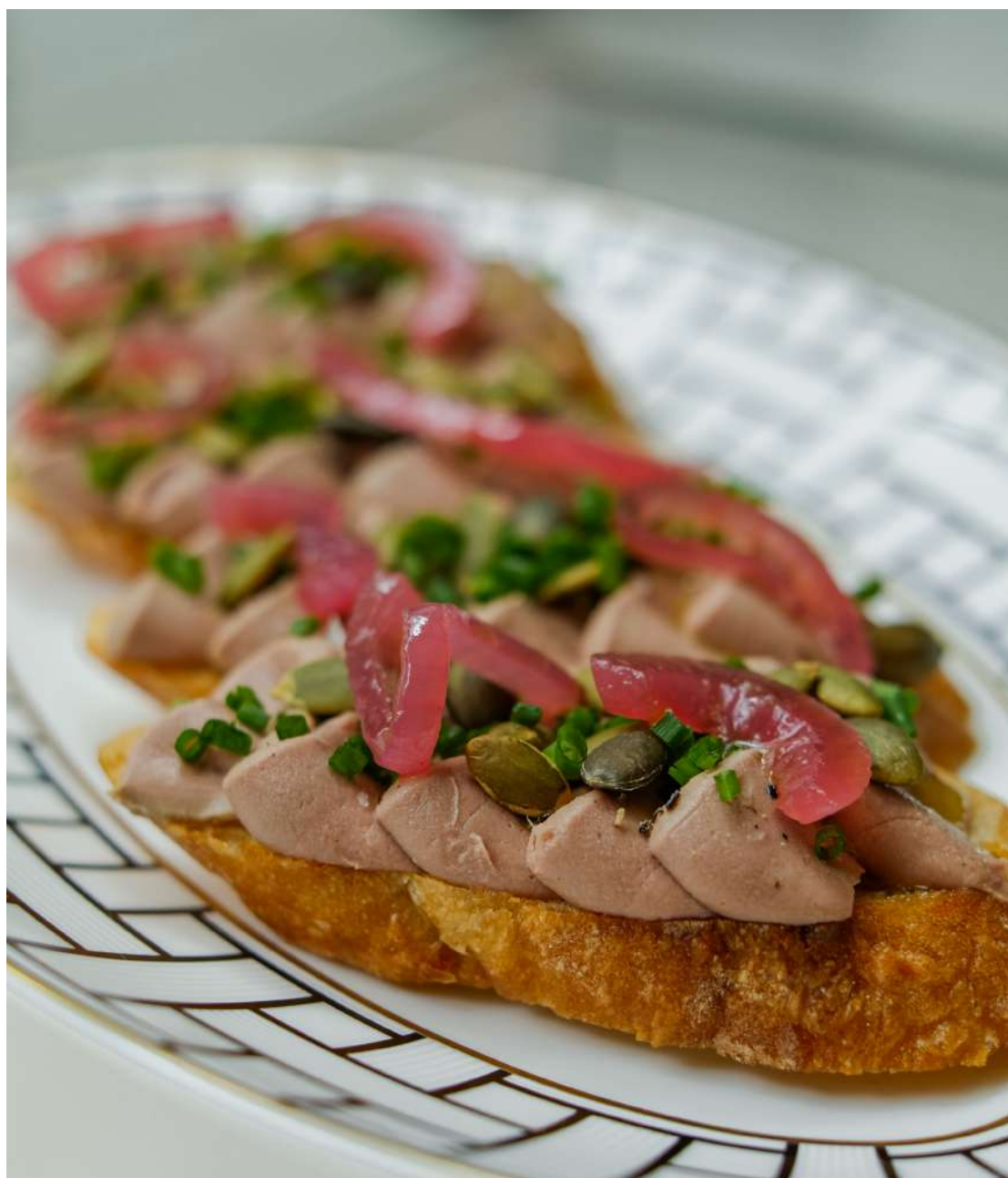
Crostini Ai Fegatini Hen liver parfait with sweet and sour onions