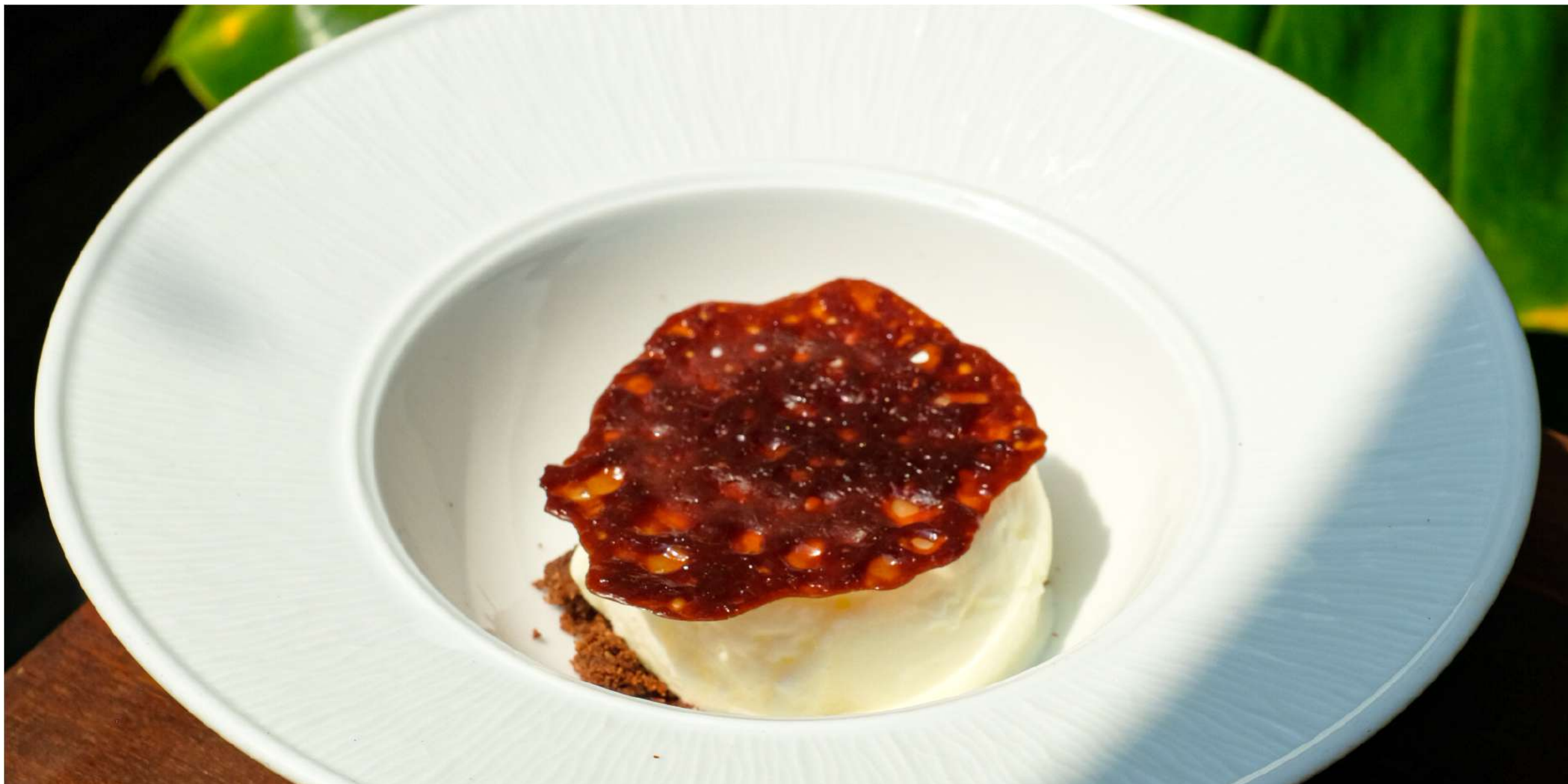
Fiordilatte E Caramello Milk ice cream with caramel sauce