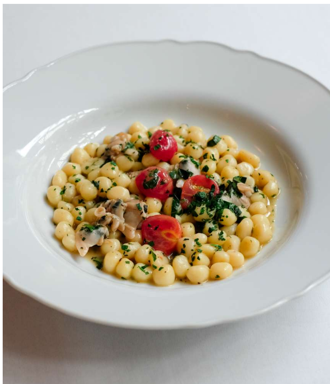
Gnocchi Alle Vongole E Bottarga, Homemade gnocchi with clams sauteed in white wine and bottarga