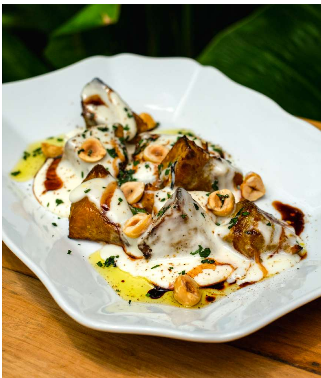
Zucca E Parmigiano Roasted pumpkin, hazelnut, Parmigiano Reggiano sauce, Marsala reduction