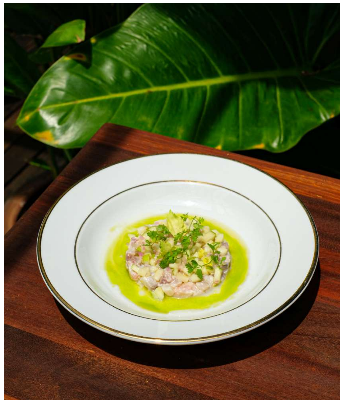
Tartare Di Branzino Seabass tartare, shallot, apple, lemon vinaigrette