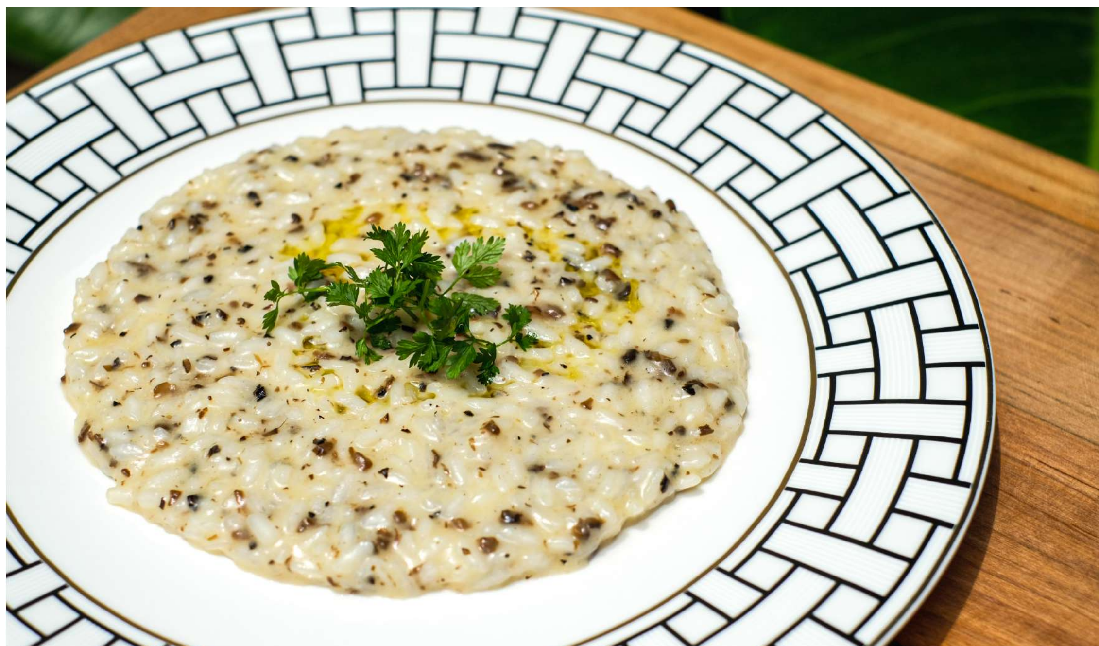
Risotto Al Tartufo, Risotto rice with truffle sauce

All prices are subjected to 10% government tax and service charge