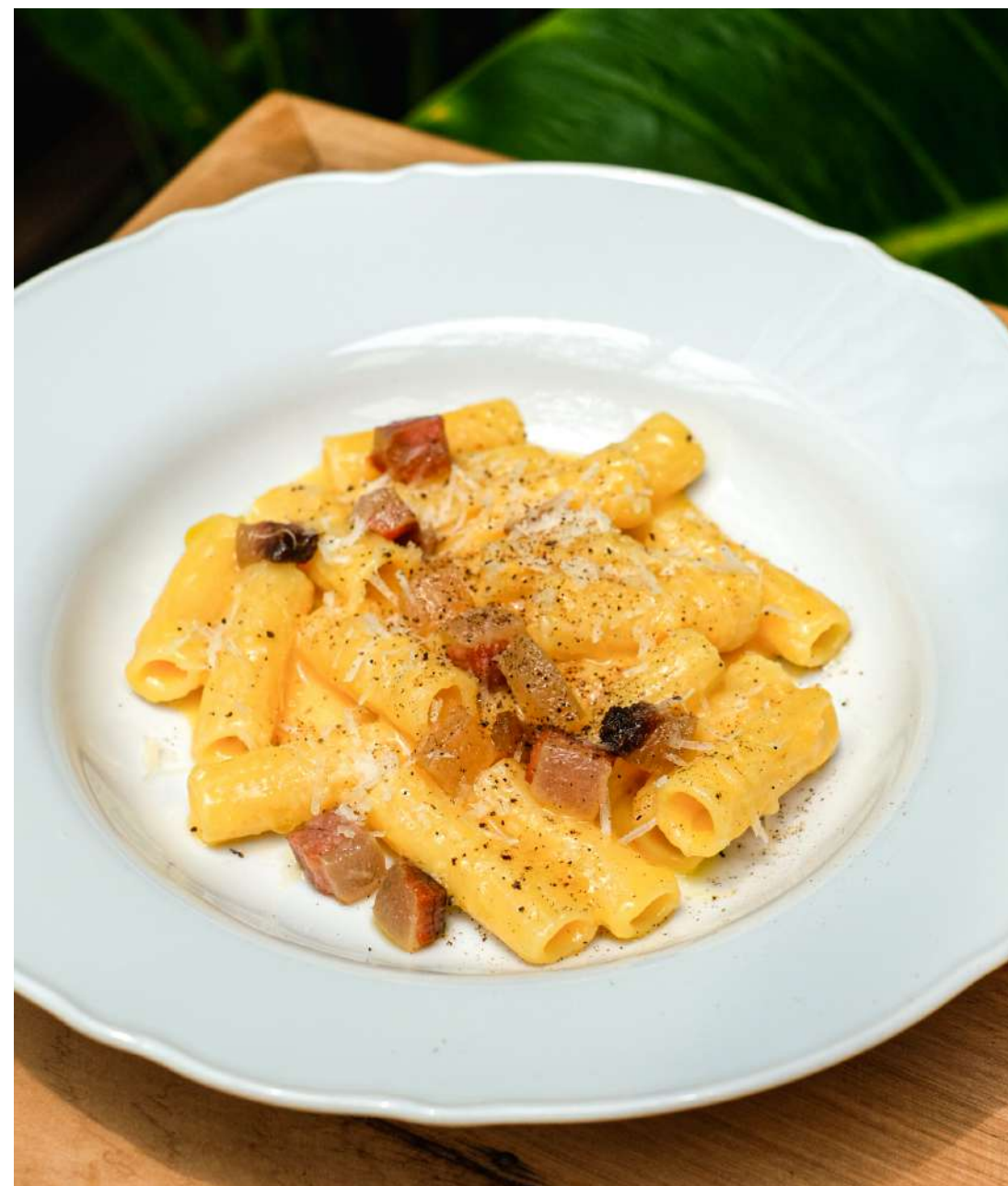
Rigatoni Alla Carbonara Guanciale, pecorino, black pepper