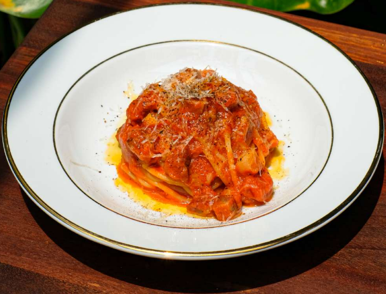
Spaghetti all'Amatriciana Rich tomato sauce, guanciale, aged cheese