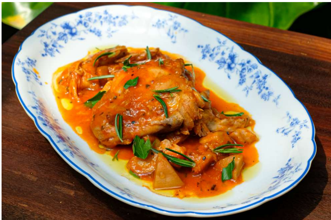
Pollo Alla Cacciatora Chicken thigh with olive, tomato and rosemary

All prices are subjected to 7% government tax and 10% service charge