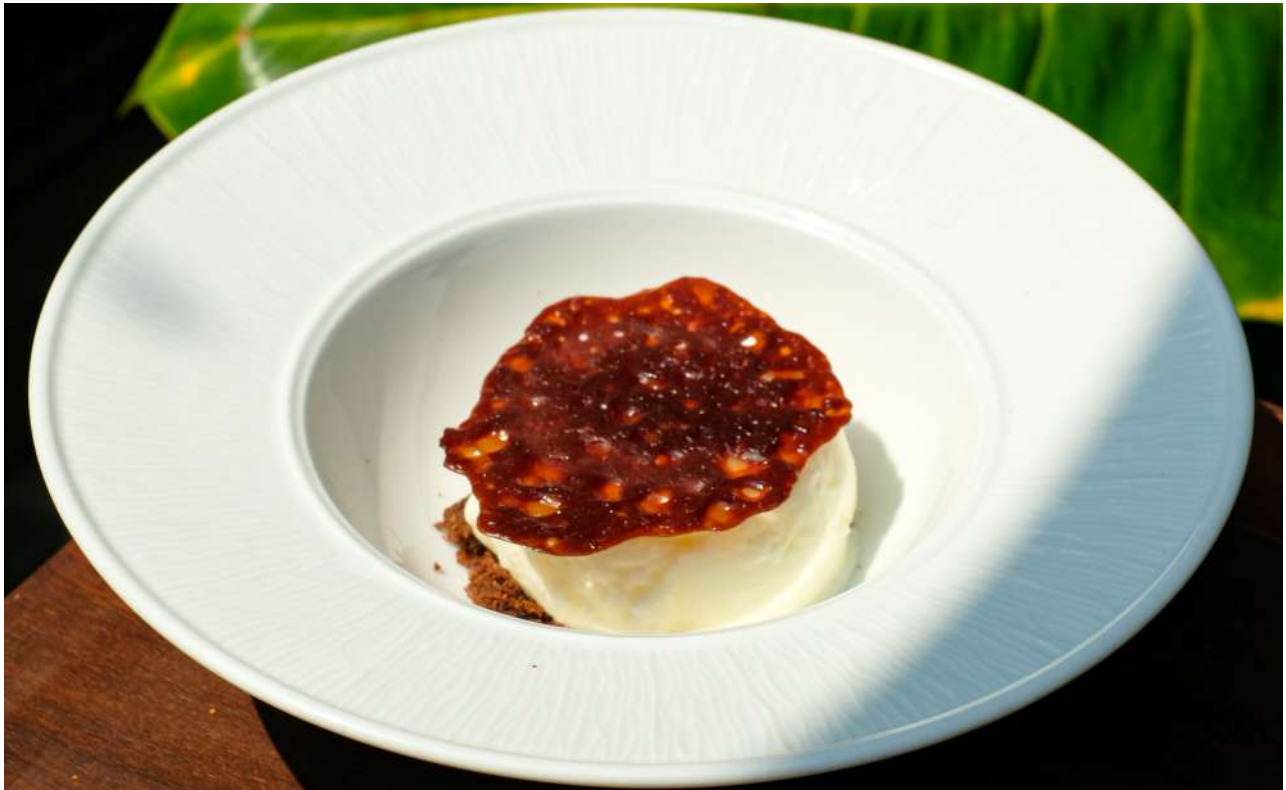
Fiordilatte e caramello, milk ice cream with caramel sauce