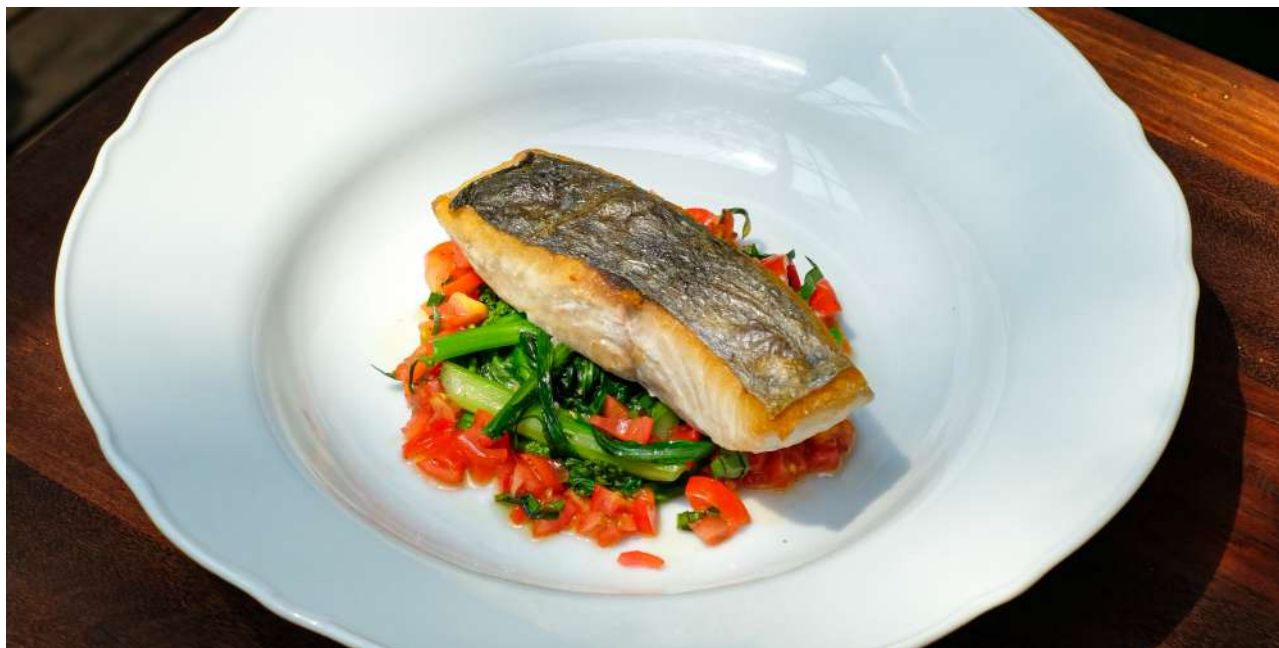
Sgombro E Friarielli Grilled Mackerel, turnip top, garlic oil chili